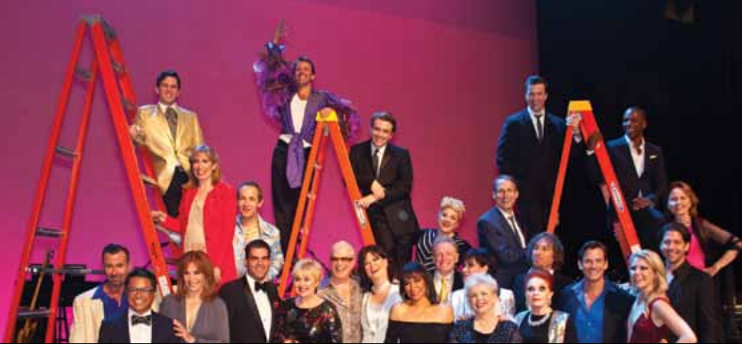
The Cast of One Night Only